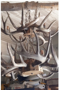
1 double-tiered WT chandelier $950.00