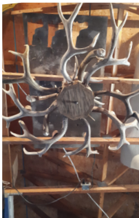
2 single-tiered MD chandeliers $750.00