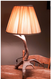
1 set of two table lamps $250.00

This is the last of my inventory, not taking any new orders, call Shawn at 403-594-4333.