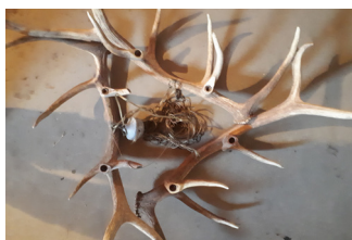
2 triangular elk horn chandeliers $500.00