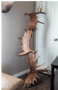
1 moose horn floor lamp $995.00