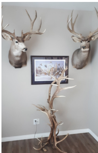
1 elk horn floor lamp $995.00